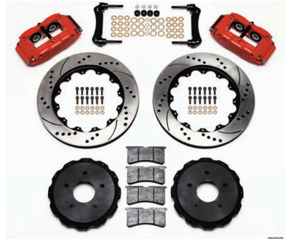
Brake Kit 140-9119

calipers with stainless steel pistons, high temperature seals, GT series directional Vane 12.88-inch competition rotors, forged aluminum hats and high friction race, compound pads. The competition kit is for use with the front race kit. If you use your Corvette for street driving or for action on the track, Wilwood offers a kit that will make it more fun to drive.