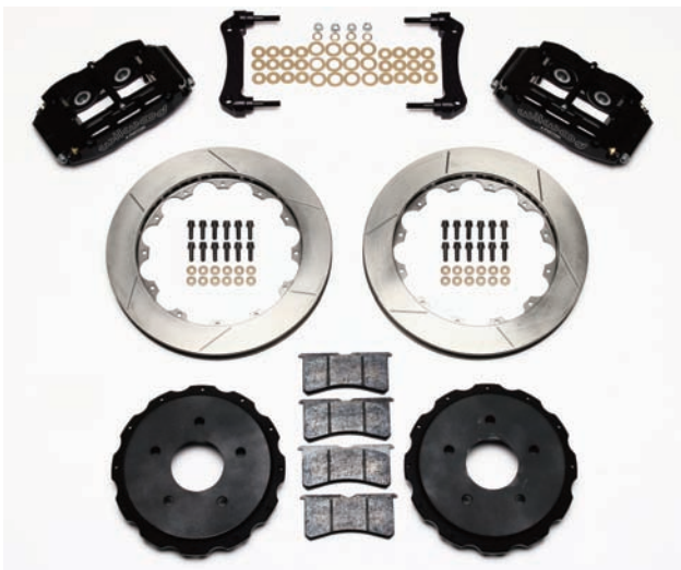
Brake Kit 140-8032

Wilwood also offers several rear disc brake kits for the 2005 and newer Corvette starting with the Superlite 4R Big Brake Rear Kit for OE parking brake system that is Wilwood part number 140-8032. The kit features Forged Superlite calipers in Platinum E or red or black powder coating, 12.88-inch rotors in slotted or drilled and slotted styles, caliper brackets and forged rotor adapter that works with the original parking brake mechanism.