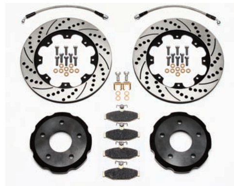
Brake kit 140-8314

The new 1997 Corvette was a big departure from the previous models and this car featured a front mounted engine and a rear mounted transmission to balance the front to rear weight distribution. The engine options were also changed and the car featured an all aluminum LS-1 engine that was developing 345 horsepower. This car also featured 18-inch rear wheels and 17-inch front wheels running unidirectional tires. The 1998 Corvette paced the Indy 500 and a special model was available. In 1999 the Corvette received a heads-up display that was projected on the windshield. A third coupe body style was also offered in addition to the hatchback and convertible, but it was a mystery why. Sales for the body style was very low but the mystery was solved when the Z06 option was released and was only offered in the lightweight coupe model. The Z06 featured a new LS-6 engine that delivered 385 horsepower for the '01 model and 405 for the '02 model year matching