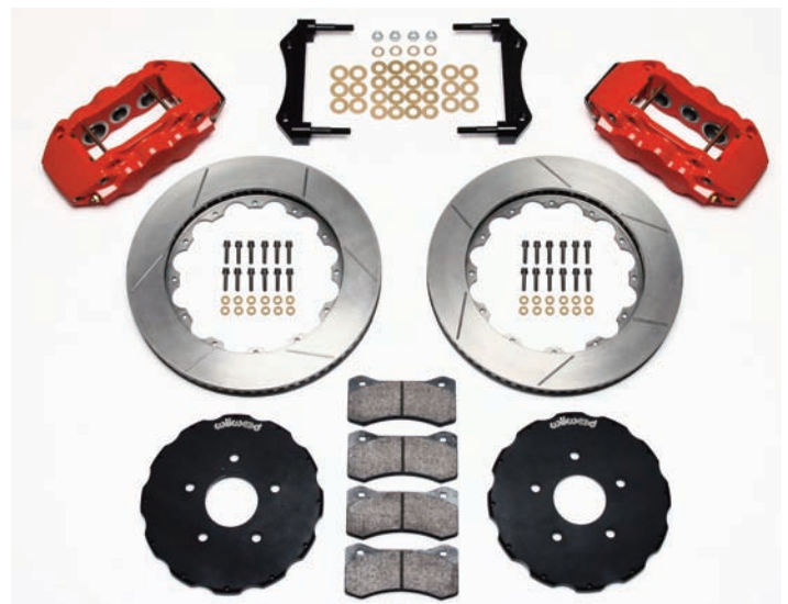
Brake Kit 140-10163

A similar kit is available with larger 14-inch rotors and it is part number 140-8922. Wilwood also offers a W6A Big Brake Front Brake Kit part number 140-10163 that features six-piston W6A calipers in Platinum-E or red and black powder coating, and 14.25-inch diameter rotors in slotted or drilled and slotted styles.