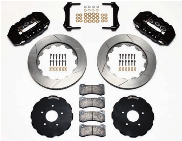
Brake Kit 140-10226

W6AR six-piston radial mount calipers with Thermlock pistons, 14.25-inch SV-GT staggered directional vane rotors, forged aluminum hats and high friction race compound pads.