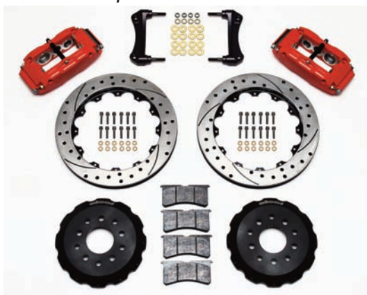
Brake kit 140-8337

Wilwood Engineering introduced a brake improvement for the 1988 through 1996 Corvettes. The brake kit being offered is the Superlite 6R Big Brake Front Brake Kit part number 140-8337 that features six-piston Forged Superlite calipers and large 12.88-inch rotors in slotted or drilled and slotted style. The big calipers are available in Platinum-E or red and black powder coat.