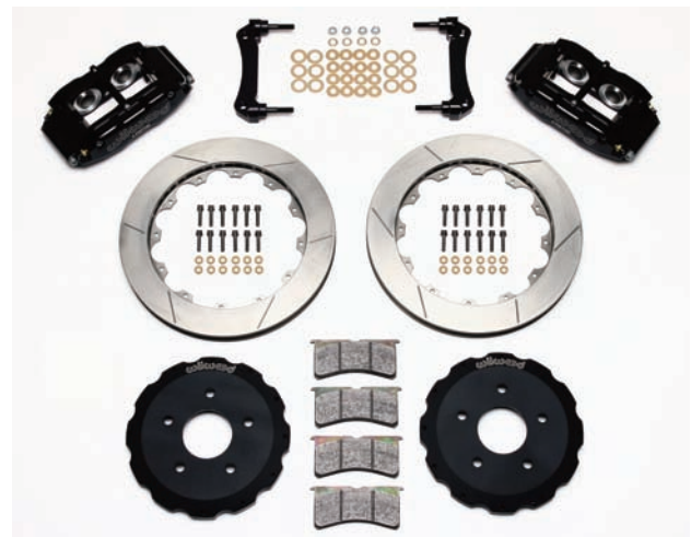
Brake Kit 140-10638