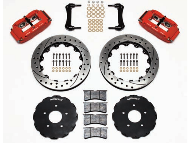
Brake Kit 140-8921

Wilwood has been offering brake improvement kits for Corvettes over the years and we are offering several race proven disc brake kits for the 2005 and newer Corvettes. One of the really impressive brake kits we offer is the Superlite 6R Big Brake Front Brake Kit part number 140-8921 that features six-piston Forged Superlite calipers in Platinum-E or black and red powder coating, and 13.06-inch rotors in a choice of slotted or drilled and slotted styles