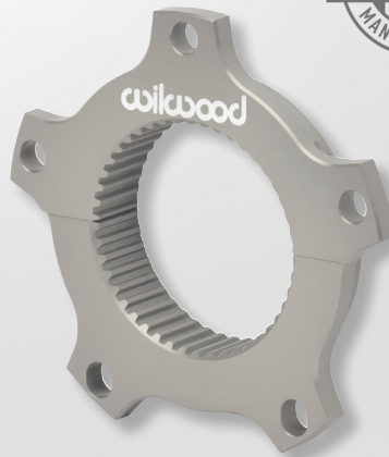
XRZ Sprint Hub Axle Clamp Spline Saver, 46 Tooth P/N 270-17657