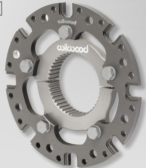
XRZ Splined Hub Kit, 8x7.00" Rotor Adapter P/N 270-17649