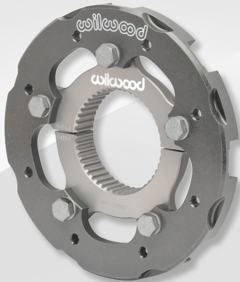
XRZ Splined Hub Kit, Lug-Drive Rotor Adapter P/N 270-17650

Rotor adapter plates are available for floating T-nut or Wilwood's Lug-Drive snap ring mount configurations. Hub with splined axle clamp is a precise fit for DMI and Winters 46 spline axles.