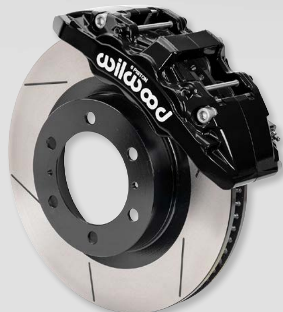
Aero6-DM Six Piston Brake Kit 13.31" GT Slotted Rotor