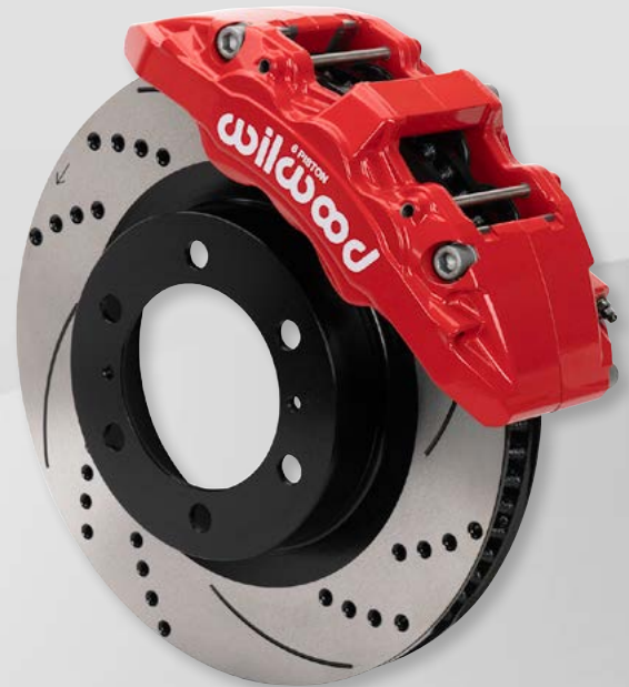
Aero6-DM Six Piston Brake Kit 13.31" SRP Drilled & Slotted Rotor