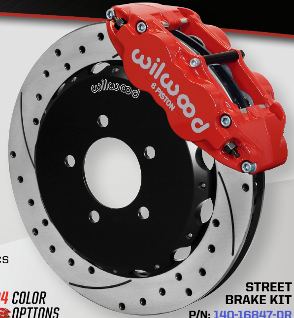
STREET BRAKE KIT P/N: 140-16847-DR