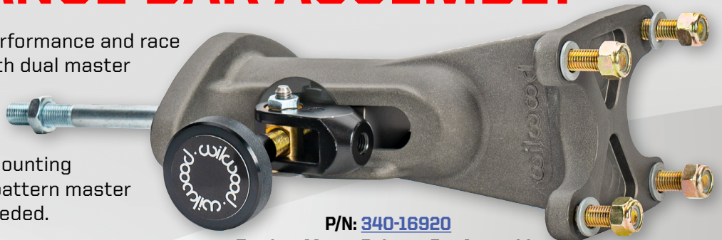
P/N: 340-16920 Tandem Mount Balance Bar Assembly