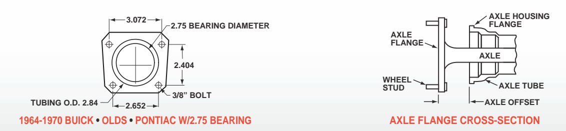
Buick • Olds • Pontiac Housing Flange / Axle Offset

PLEASE CHECK: WILWOOD ALWAYS RECOMMENDS CHECKING THEIR WEBSITE, www.wilwood.com FOR COMPLETE YEAR/MAKE/MODEL APPLICATION DATA AND SPECIFIC WHEEL CLEARANCE REQUIREMENTS.