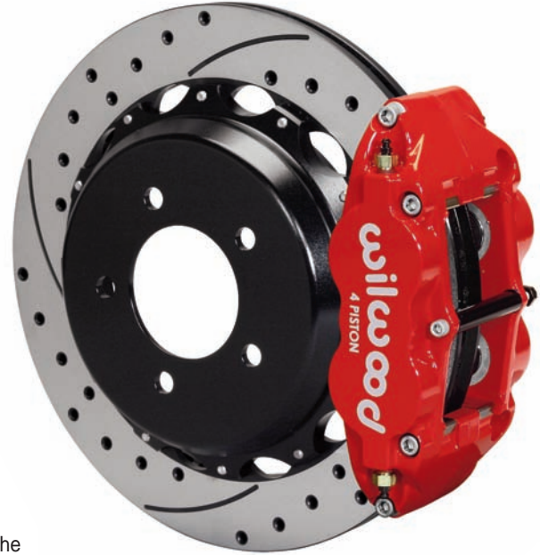
FNSL4R Rear Kit Assembly To Download High Res Photo, Click Here