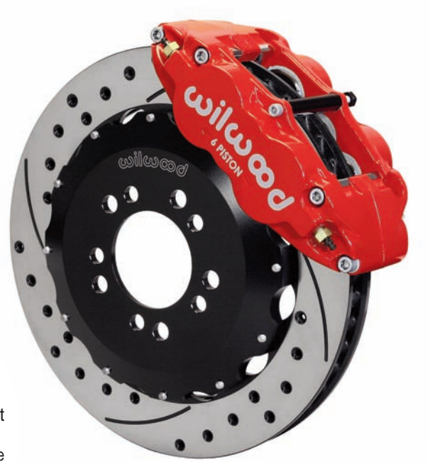
FNSL6R Kit Assembly, 13.06" Shown To Download High Resolution Photo, Click Here