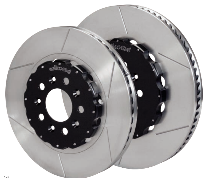
ProMatrix Front / Rear Kit Assembly Download High Res Photo, Click Here

Bolt kits include premium grade 12 point stainless steel rotor bolts to provide corrosion-free and positive retention of the rotor to the hat.