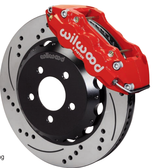
Big Brake Front Kit Assembly with Red Caliper and SRP Rotor Download High Res Photo, Click Here