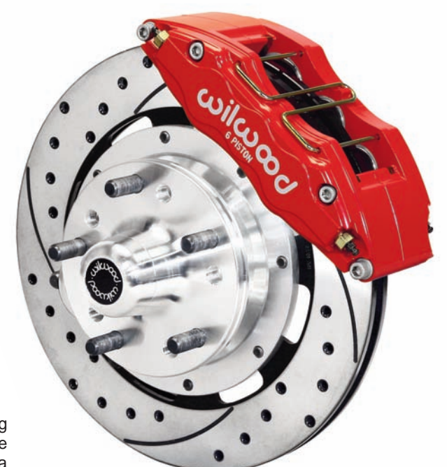
Front Kit with SRP Rotor and Red Caliper Download high resolution photo, click here