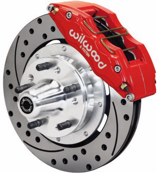
Front Kit with SRP Rotor and Red Caliper

Download high resolution photo, click here