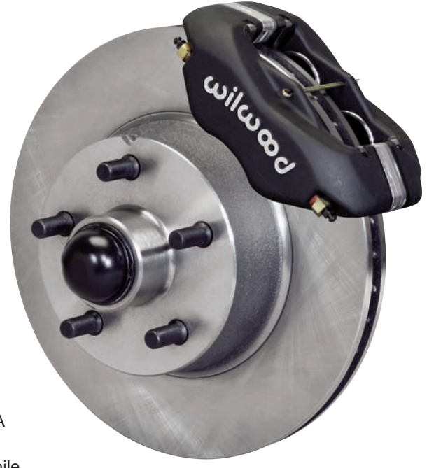
Front Dynalite Classic Series Kit Download high resolution photo, click here