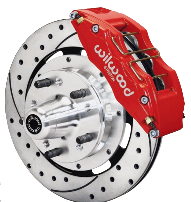
Front Kit with SRP Rotor and Red Caliper Download high resolution photo, click here