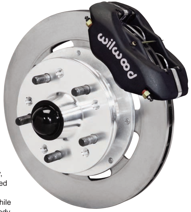
Front Dynalite Classic Series Kit Download high resolution photo, click here