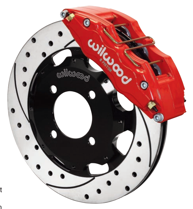
Front Kit with SRP Rotor and Red Caliper Download high resolution photo, click here