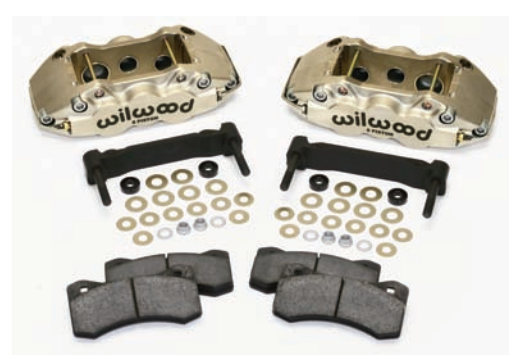
W6AR Caliper and Bracket Upgrade Kit (Calipers Shown in "Quick-Silver" Finish) Download High Res Photo, Click Here