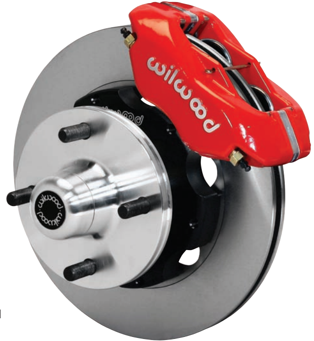
Pro Series Front Kit with ULHP Rotor and Red Caliper

Download High Resolution Photo, click here