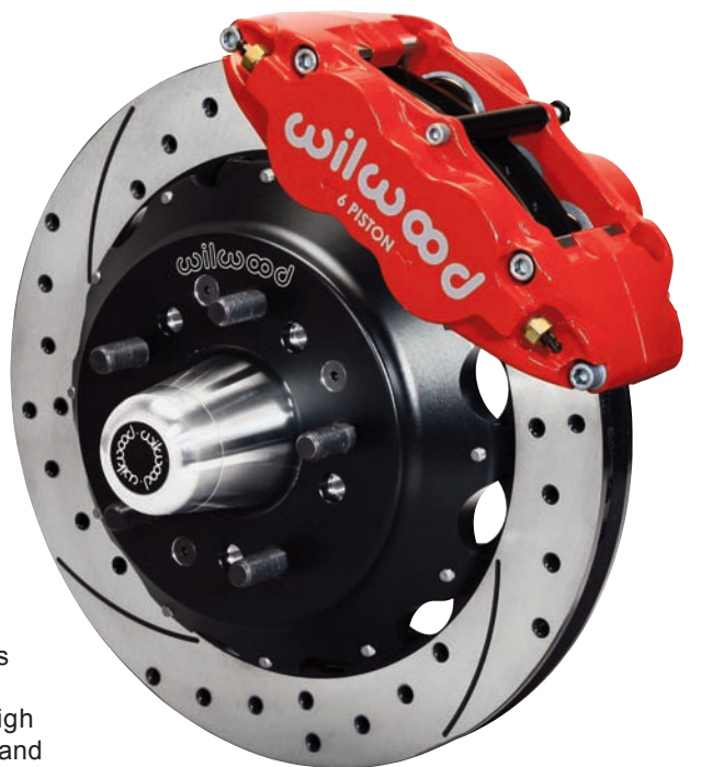
Big Brake Front Kit with SRP Rotor and Red Caliper Download High Resolution Photo, click here