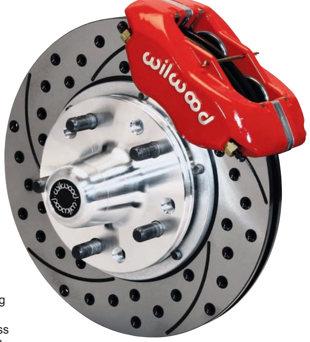
Pro Series Front Kit with SRP Rotor and Red Caliper Download High Resolution Photo, click here

- 4700 Calle Bolero • Camarillo, CA 93012 • www.wilwood.com • Sales: (805) 388-1188 • E-mail Tech Assistance: support@wilwood.com - 268 REV DATE: 06-07-12