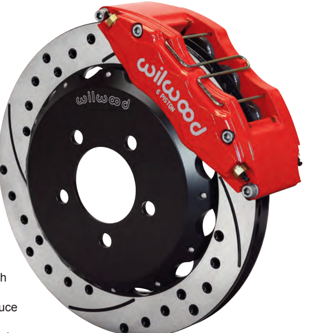
Factory Five Roadster Big Brake Front Kit with SRP Rotor and Red Caliper