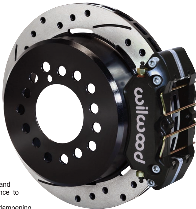
Rear Parking Brake Kit with SRP Rotor