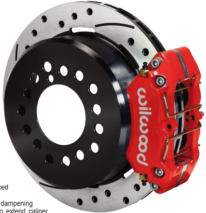
Brake Kit with Optional SRP Rotor and Red Caliper Down Load High Res Photo, Click Here

Please check the diagram on the back of this page for minimum inside wheel clearance requirements