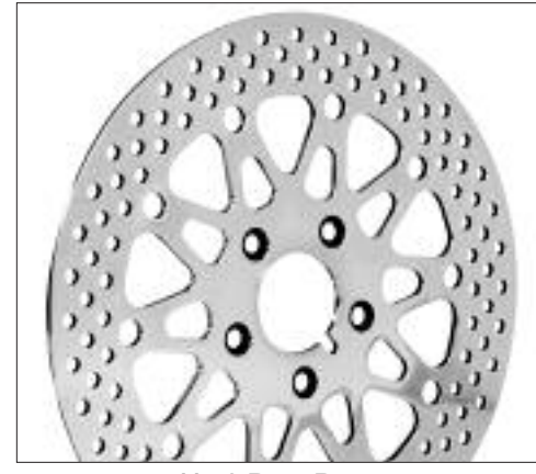
11.50 Rear Rotor