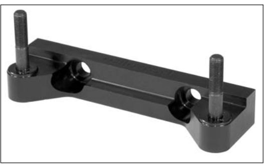
DynaPro Caliper Mounting Bracket P/N 250-9595