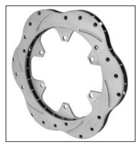
PolyMetallic Titanium Rotor • P/N 160-9363

4700 Calle Bolero • Camarillo, CA 93012 • www.wilwood.com • Sales: 805 / 388-1188 • Fax: 805 / 388-4938