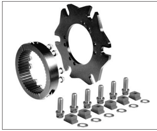
Axle Clamp, Rotor Adapter, & Bolt Kit • P/N 270-9761