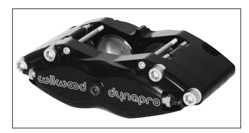
DynaPro Caliper • P/N 120-8544-SI