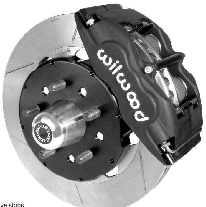
Big Brake Front Kit with GT Rotor