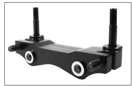
Powerlite Caliper Mounting Bracket