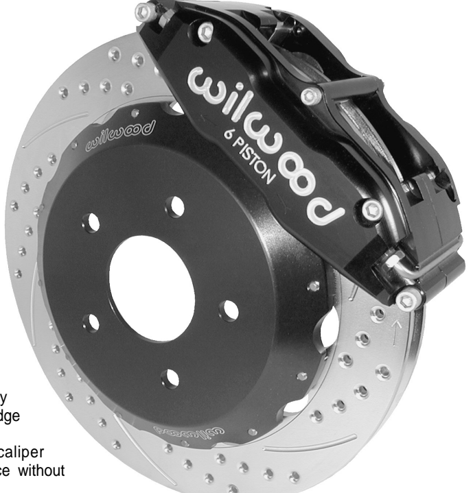
Corvette C-4 Big Brake Front Kit with SRP Rotor