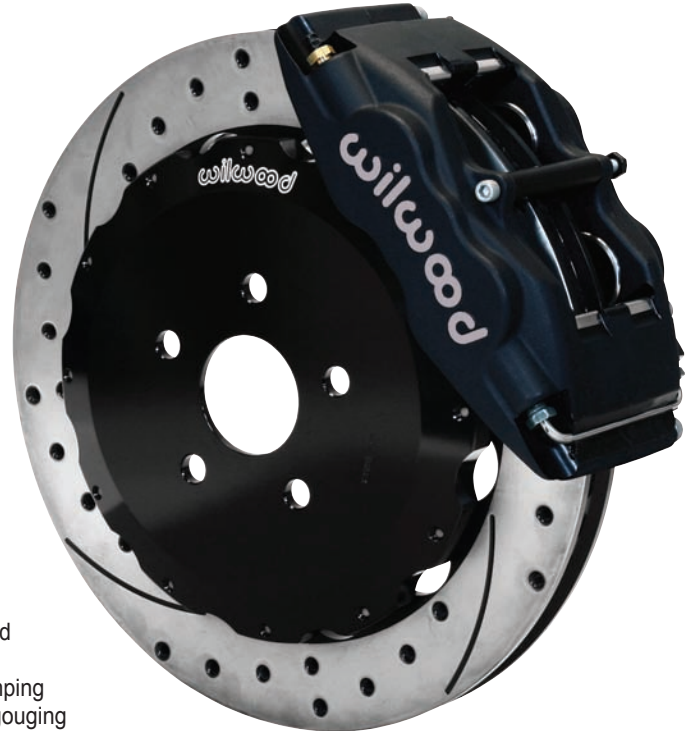
Scion Big Brake Front Kit with SRP Rotor